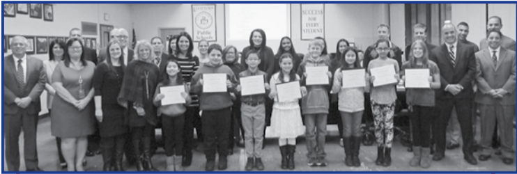
The Board of Education and administration are pictured with the school-level spelling bee winners who attended the Hofstra Scripps Spelling Bee.